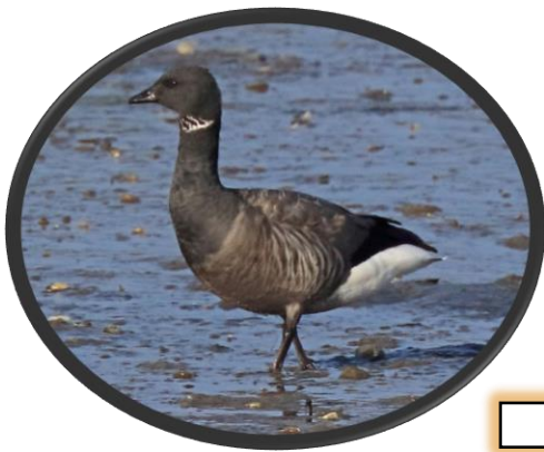
Dark-Bellied Brent Goose